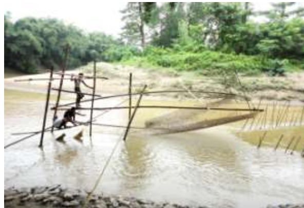
FIG: A Large sized Dheki Jal