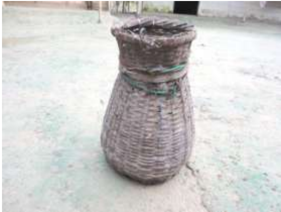
FIG: A Khaloi

Yedave, Y.S. et al, (1987) Linnology and productivity of Dighali Beel, Assam, India trop. Ecol. 28(2)137-146.