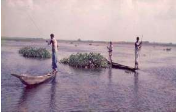
FIG: Katal Fishing