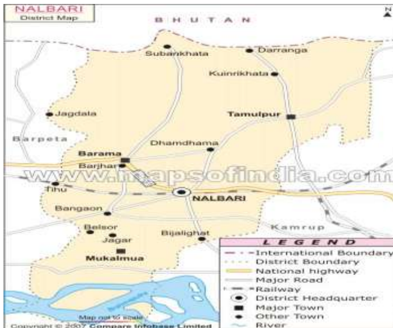
Fig- 1: MAP OF NALBARI DISTRICT