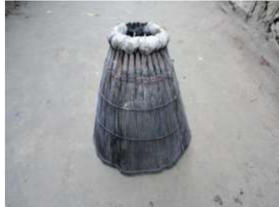
FIG: A Juluki