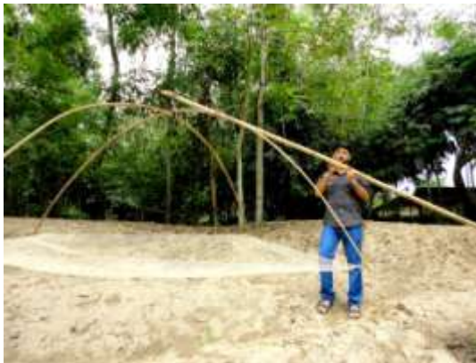
FIG: A Small sized Dheki Jal