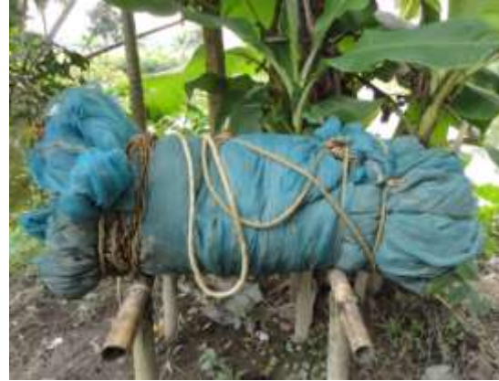
FIG: A Mushari Jal