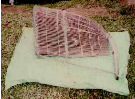
FIG: A Darki