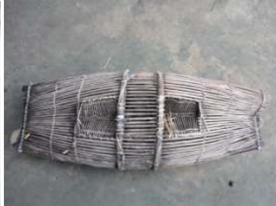
FIG: A Chepa