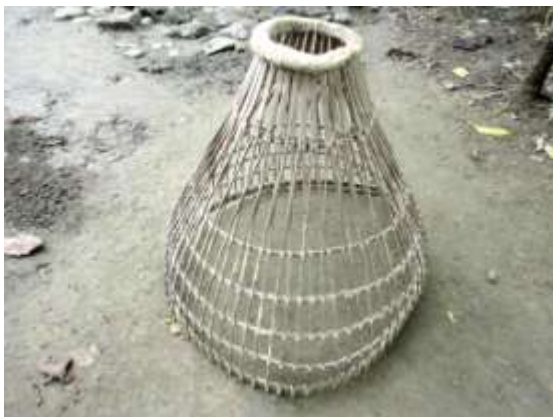
FIG: A Polo